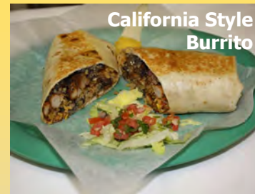
California Style Burrito

*Consuming raw or undercooked meat, eggs, or seafood may increase your risk of foodborne illness.